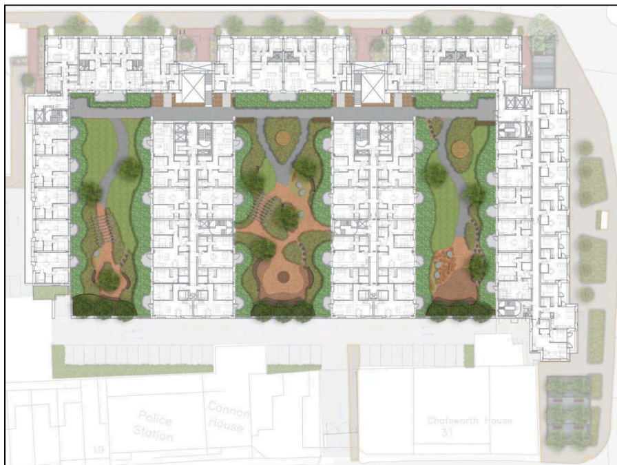
Plan showing first floor level podium gardens and pocket parks etc at ground level

The open space in relation to 'Play Space' is met by the provision of a series of safe and accessible play spaces in the podium level garden. Play spaces are designed to meet the needs of the different age ranges of users, whilst also benefiting from passive surveillance. The eastern garden would be focused on play for family recreation with a children's play area for younger children. The central garden would provide a mixed space for all as a residential community activity hub. This space would incorporate elements of play space along with more seating and planting. The western garden would provide a quieter space with tree and shrub planting to provide a green enclosure.